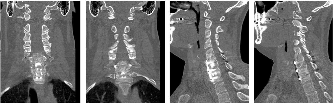
Figure 3. CT at 6 month follow up showing fusion from C5-T1.

The patient showed improvement in her VAS scores from 10 to 5. Despite persisting symptoms her CT's at 6 months and 13 months following surgery showed solid fusion from C5-T1.